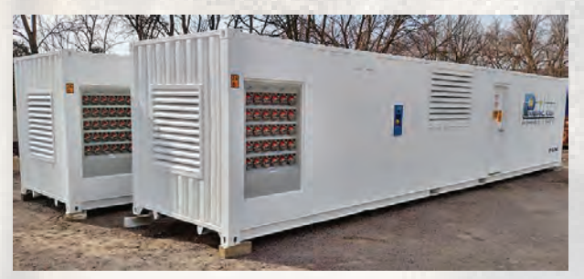
EVERY PORT OPERATION IS UNIQUE. YOUR POWER PACK CAN BE TOO.

All items are subject to change without notice. Please contact Power Pool Plus for the most current information.