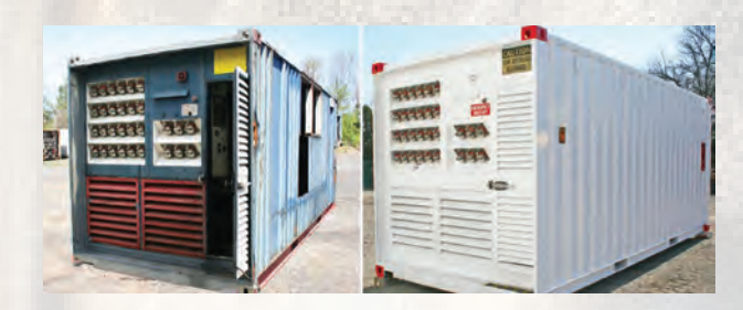
FROM OLD TO LIKE-NEW, A money saving solution that builds new life into worn out power packs.

All items are subject to change without notice. Please contact Power Pool Plus for the most current information.